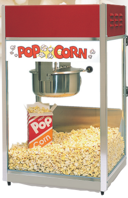
Ultra 60 6 oz. Popper 19"W x 17.5"D x 31"H