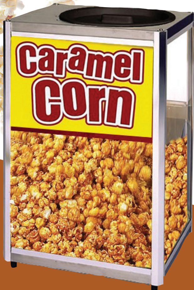
Caramel Corn Warmer