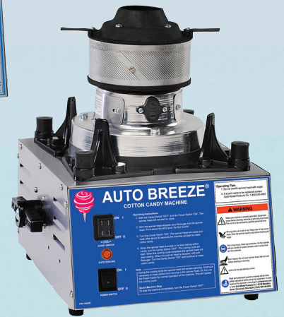
Auto Breeze Cotton Candy Machine 3052