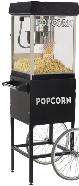
Fun Pop 4 oz. Popper With Cart