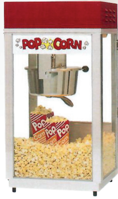
Super 88 8 oz. Popper 18.5"W x 17"D x 35"H