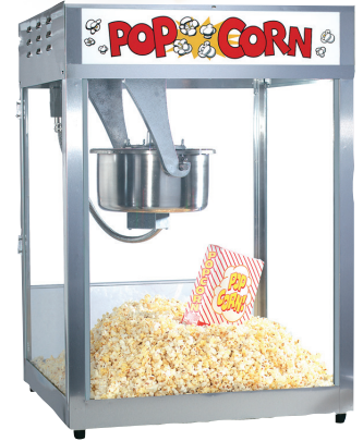
Macho Pop 16 oz. Popper 26"D x 26"W x 37"H