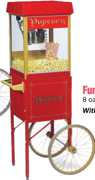
Fun Pop 8 oz. Popper With Cart