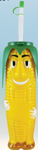
"The Kernal" Corn Cup "The Kernal Sr." 32 oz. • 8025565 50 ct.