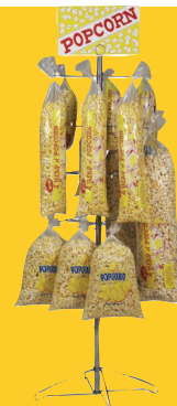
66" Floor Merchandiser

Filler Funnel & Merchandiser Included With Purchase of Either Machine!