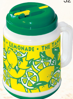
"Lemonade" Tanker 64 oz. • 8021602 12 ct.