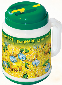
"Lemon Ice" Tanker 64 oz. • 8021603 12 ct.