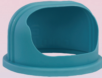
Floss Bubble • Pink • Blue • Clear