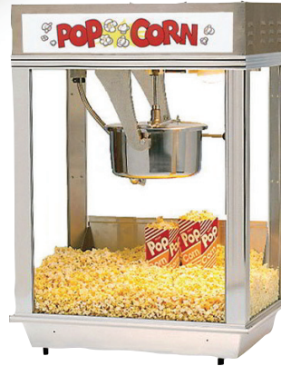
Deluxe Stainless Steel Whiz Bang w/lighted sign 12 oz. Popper 20.25"D x 28"W x 40"H