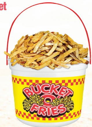
French Fry Bucket 48 oz. • 8021450 160 ct.