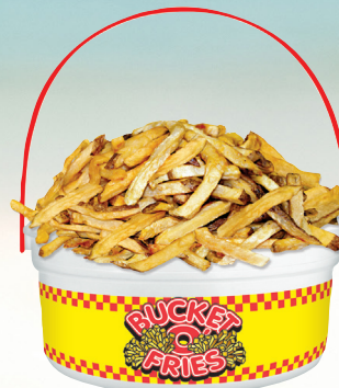
French Fry Bucket 24 oz. • 8021451 200 ct.