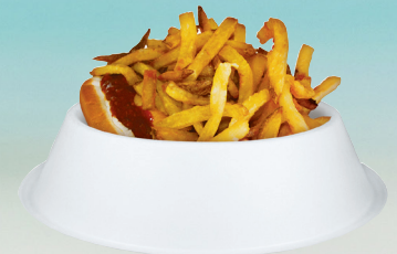
"Doggie" Pup Bowl 1275130 250 ct.