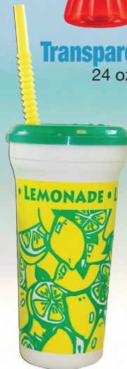
Lemonade Souvenir Cup With Lid & Straw 32 oz. • 8021590 300 ct.