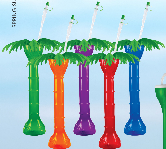
Assorted Palm Tree Cup 24 oz. • 8011691 48 ct.

Ask Sales Rep for Complete Berk Catalog *Case Counts are Subject to Change