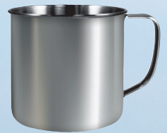
Stainless Steel Mug 32 oz. • 8032486 80 ct.