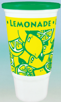
Economy Souvenir Car Cup With Lid & Straw 32 oz. • 8021550 504 ct.