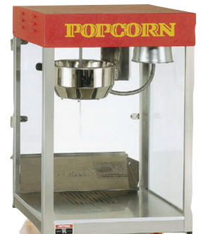
Cretors T-3000 12 oz. Popcorn Machine

We invented the popcorn machine THEN JUST KEPT GOING!