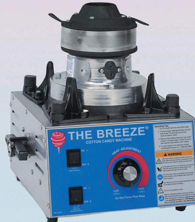
Breeze Cotton Candy Machine 3030

Receive 10% off your opening supply order with the purchase of a new machine!