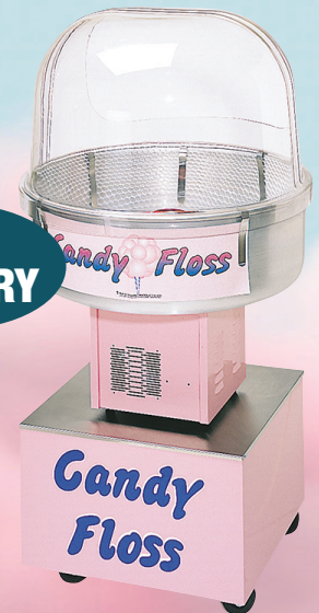
Floss About Cart