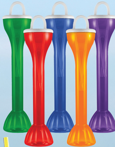
Transparent Half-Yarder 24 oz. • 8011390 33 ct.