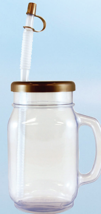
Mason Jar 28 oz. • 8029630 72 ct.