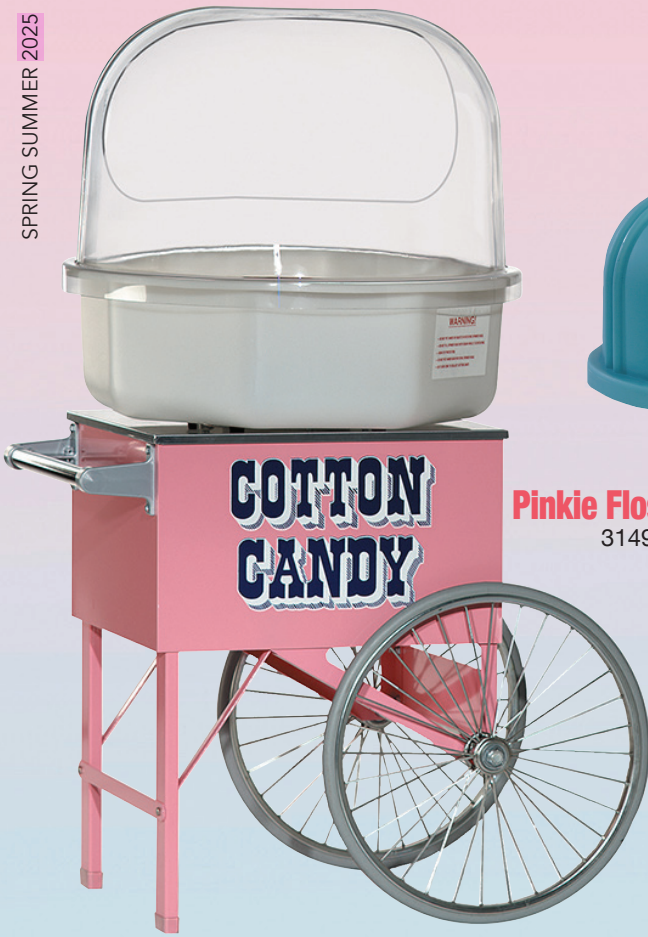
Pinkie Floss Cart 3149